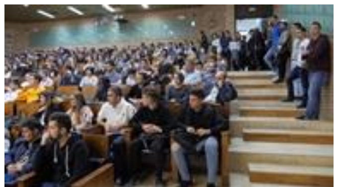
The Career Fair in CMU premises on 19 th October 2018

On November 15, Marine Cluster Bulgaria organized the second Blue Career Fair in Varna, Bulgaria. The event gathered more than 250 participants - students from high schools and universities, representatives of educational institutions and business, Professionals of maritime sectors presented to the audience career opportunities in various blue sectors. In the afternoon a matchmaking session allowed the students to get additional information from companies, training centers and recruiting agencies.