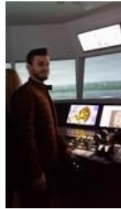
Romanian students visit at training simulators.

The second edition of the successful Blue Career Fairs at the end of 2017 will also be held in Greece and Cyprus: