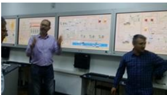
Visit to the Engine Simulator Room (CMU)

In addition, the second Blue Career Fair in Romania followed the Consortium meeting on October 19, where local business representatives presented numerous career opportunities to students, guests and interested parties. Ten Bulgarian students also visited this event and had the opportunity to get familiar with the available training