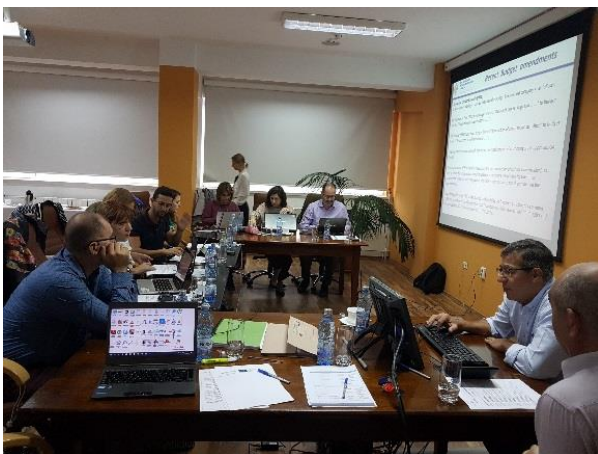
The second MENTOR meeting hosted by the Constanta Maritime University (CMU), Constanta, Romania, 18 October 2018

October also proved to be an eventful month, hosting the second MENTOR consortium meeting kindly held at the premises of the Constanta Maritime University (CMU) in Romania. The hospitality of the hosts and the superb meeting arrangements were complemented by a tour to the labs and simulator rooms of CMU.