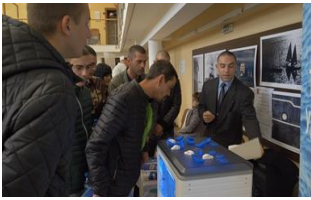
Learning more about 3D printer use opportunities