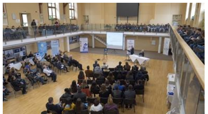
The Career Fair in Varna on 15 th November 2018

On November 15, Marine Cluster Bulgaria organized the second Blue Career Fair in Varna, Bulgaria. The event gathered more than 250 participants - students from high schools and universities, representatives of educational institutions and business, Professionals of maritime sectors presented to the audience career opportunities in various blue sectors. In the afternoon a matchmaking session allowed the students to get additional information from companies, training centers and recruiting agencies.