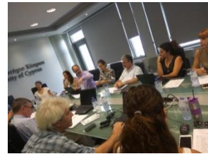
“The MENTOR Project & Other Blue Initiatives in Cyprus” workshop